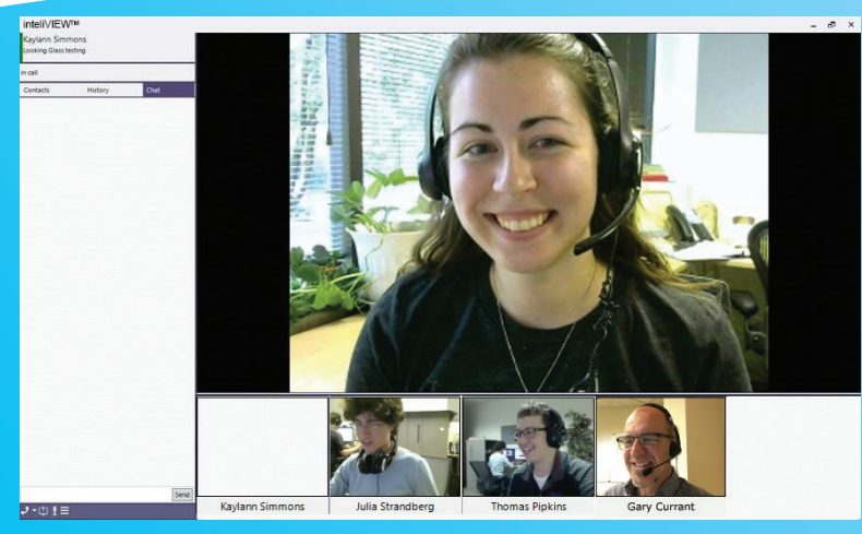
^ Multi-station video conference in progress.

Ideal for managing remote team members and at-home workers.